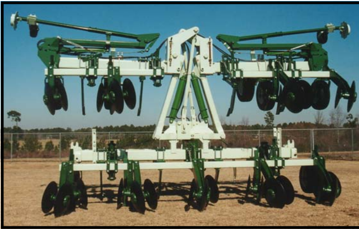
Stack Fold toolbars (8, 10 and 12 row ripper bedders & disc bedders). Shown with optional hydraulic folding row markers.