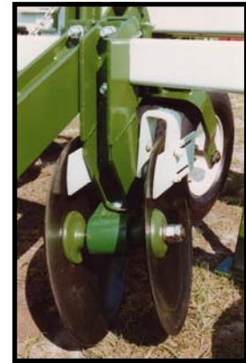
Double (20" & 18" dia.) or single (20" dia.) disc gangs with cast iron hubs and triple sealed bearings.