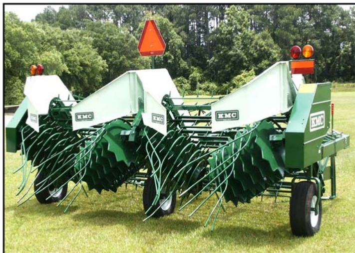
4 Row: MORE DIGGING CAPACITY THAN 2-ROW MODEL WITH NEW DESIGN IMPROVEMENTS FOR BETTER PERFORMANCE.