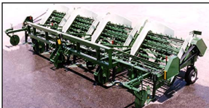
8 Row: MAXIMUM CAPACITY DIGGING. ALLOWS EIGHT ROWS TO BE INVERTED UNIFORMLY AND SPACED EVENLY.