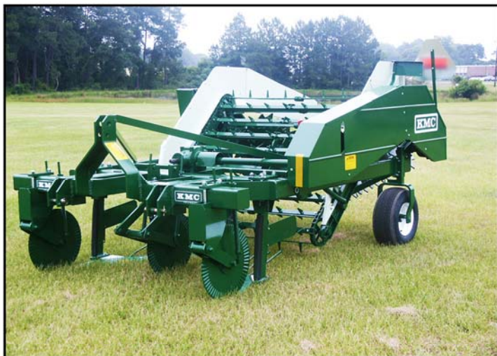
2 Row: POPULAR CHOICE OF SMALL TO MEDIUM ACREAGE PRODUCERS.