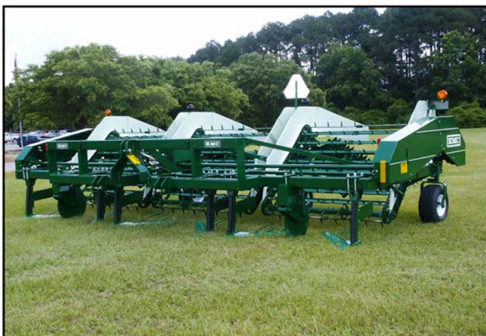
6 Row: FAVORITE OF 6-ROW GROWERS WHO WANT TO HARVEST FASTER WITH REDUCED LABOR, TRACTOR, AND FUEL EXPENSE. UTILIZES HARD TRACTOR WHEEL MIDDLES FORMED DURING PLANTING, ALLOWING ALL SIX ROWS TO BE INVERTED UNIFORMLY AND SPACED EVENLY.