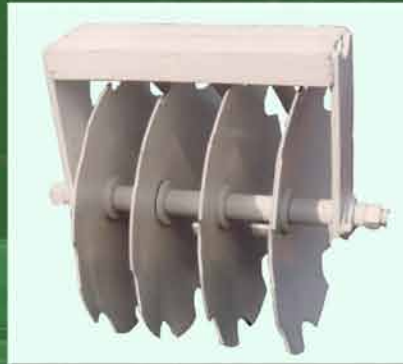
NOTCHED DISC (16" FOR HEAVY RESIDUE AND MANY SPECIALIZED APPLICATIONS)