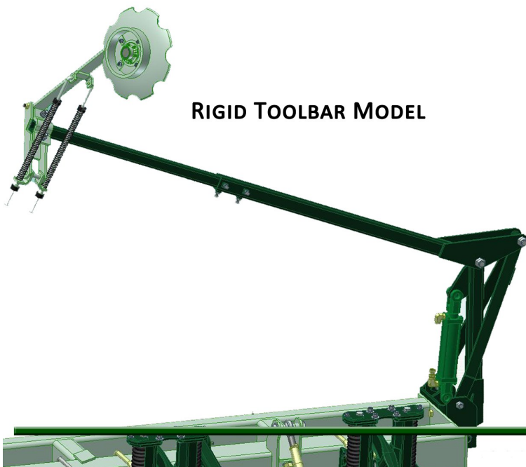
RIGID TOOLBAR MODEL

(NOT FOR USE WITH PREVIOUS MODEL TOOLBARS)