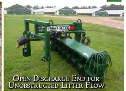
OPEN DISCHARGE END FOR UNOBSTRUCTED LITTER FLOW