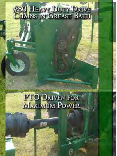
#80 HEAVY DUTY DRIVE CHAINS IN GREASE BATH