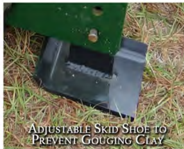
ADJUSTABLE SKID SHOE TO PREVENT GOUGING CLAY