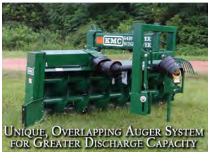
UNIQUE, OVERLAPPING AUGER SYSTEM FOR GREATER DISCHARGE CAPACITY