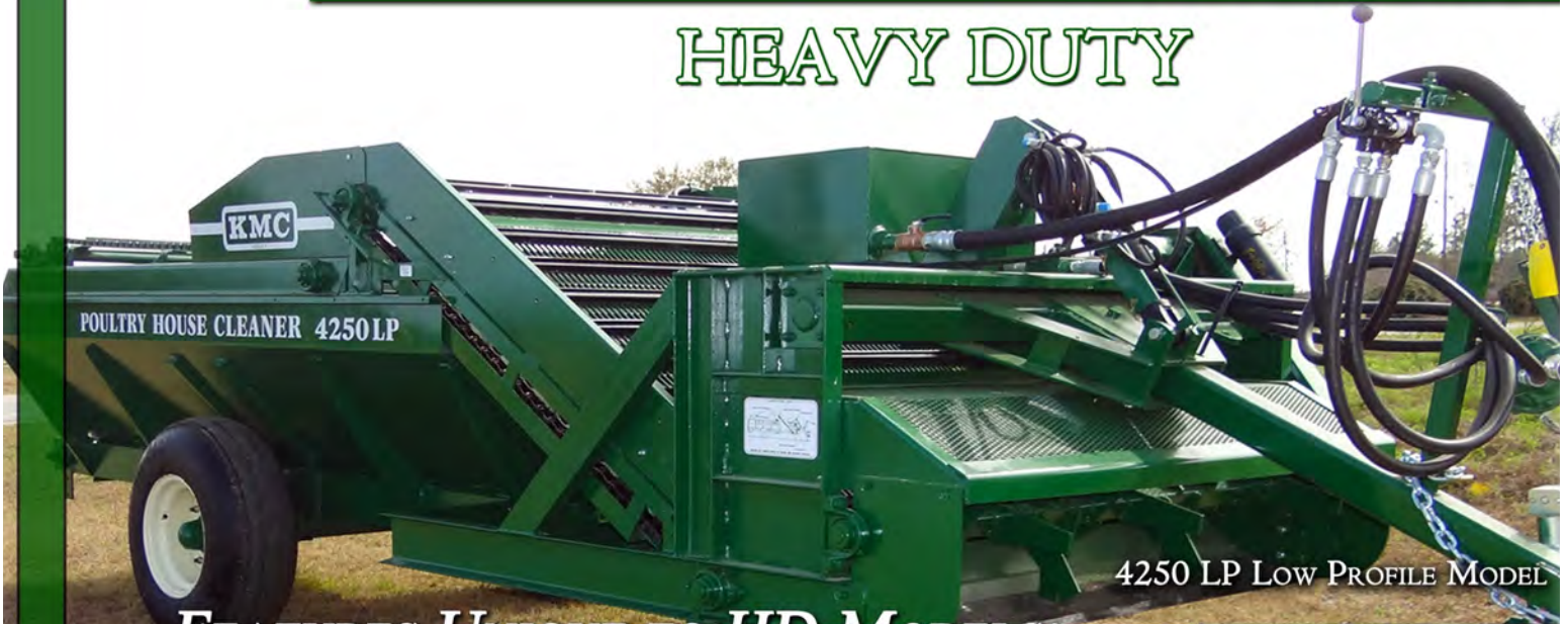
4250 LP Low Profile Model