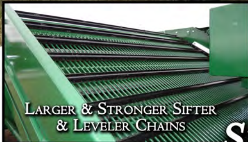
LARGER & STRONGER SIFTER & LEVELER CHAINS