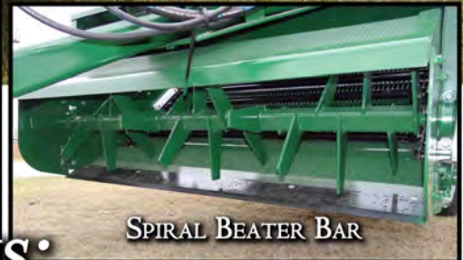
SPIRAL BEATER BAR