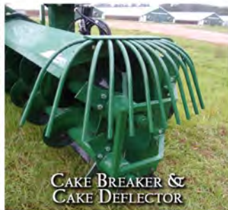
CAKE BREAKER & CAKE DEFLECTOR